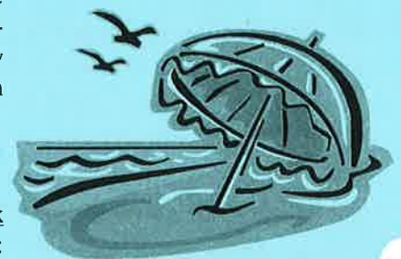
Have a safe and enjoyable summer!

City residents will receive your 2010 summer tax bill the first week of July. Summer tax bills are due by September 14, 2010. Tax and assessing information can be found online at: www.city-chelsea.org select Tax/Assessing from the menu at the left of the screen. For tax questions, please contact the City Treasurer at 475-1771—extension 207 or the Deputy Treasurer at extension 205.